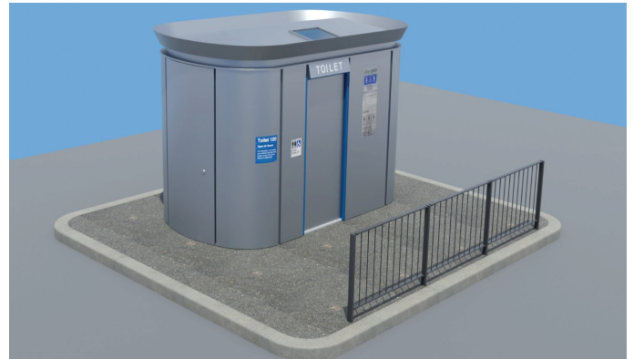
An artist's impression of the new public toilet