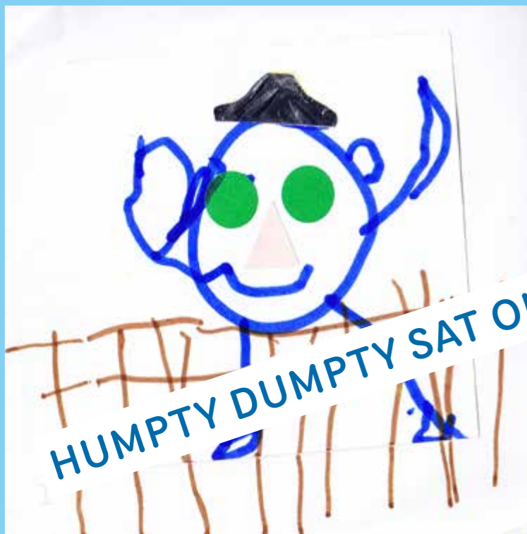
HUMPTY DUMPTY SAT ON A WALL,