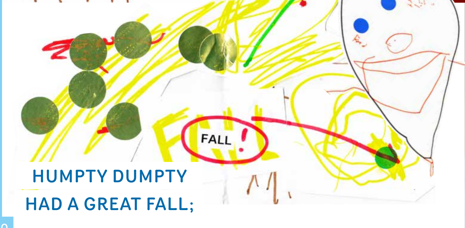
HUMPTY DUMPTY HAD A GREAT FALL;