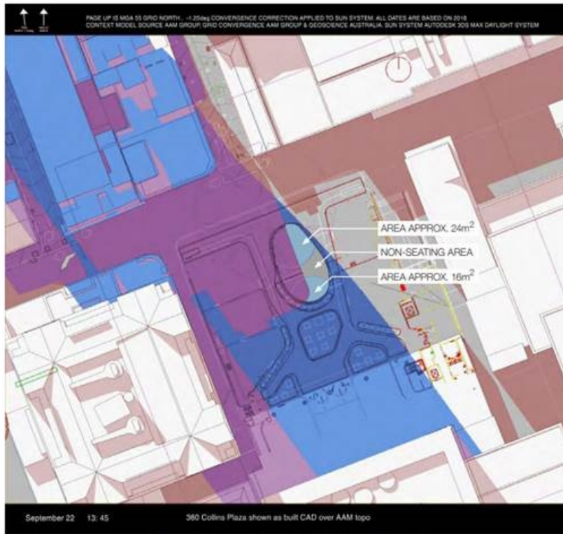
REVISED COMPLIANT SCHEME (SEP 2019)