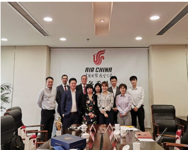
With colleagues from Visit Victoria, Melbourne Airport and Air China.