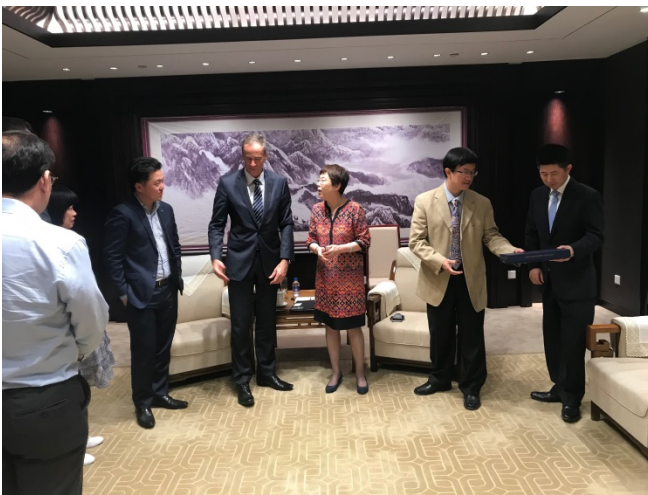
Meeting with the Republic of China (PRC) Ministry of Culture and Tourism in Beijing, China.