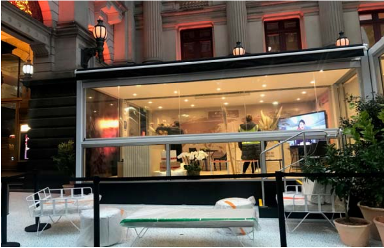
China Eastern pop-up during Melbourne Fashion Week.