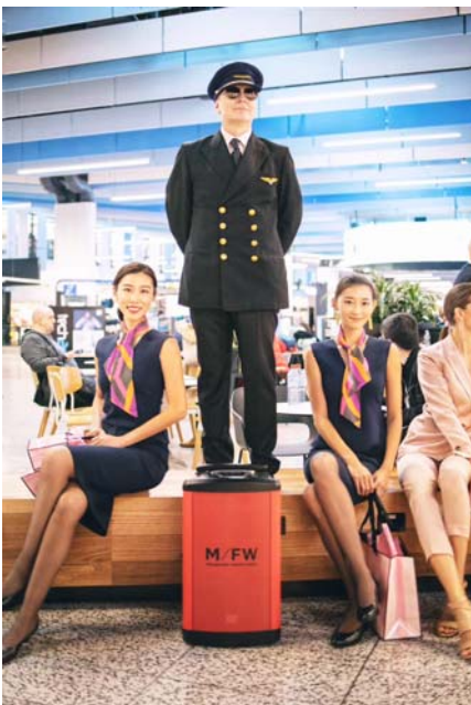
Promotion of Melbourne Fashion Week at Melbourne Airport by KOLs.