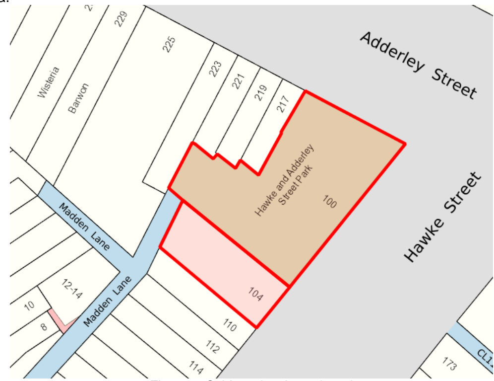
Figure 1: Subject site shown in red

The subject site is located on the western corner of Hawke and Adderley Street in West Melbourne. Madden Lane is located to the rear of the site. The site is irregular in shape and has a total site area of 1083m^2 . The site is currently used for the Hawke and Adderley Street Park and there is a single storey warehouse built on the southern portion. A planning permit has been issued for the demolition of the warehouse to increase the size of the park. The subject site is located in a residential area.