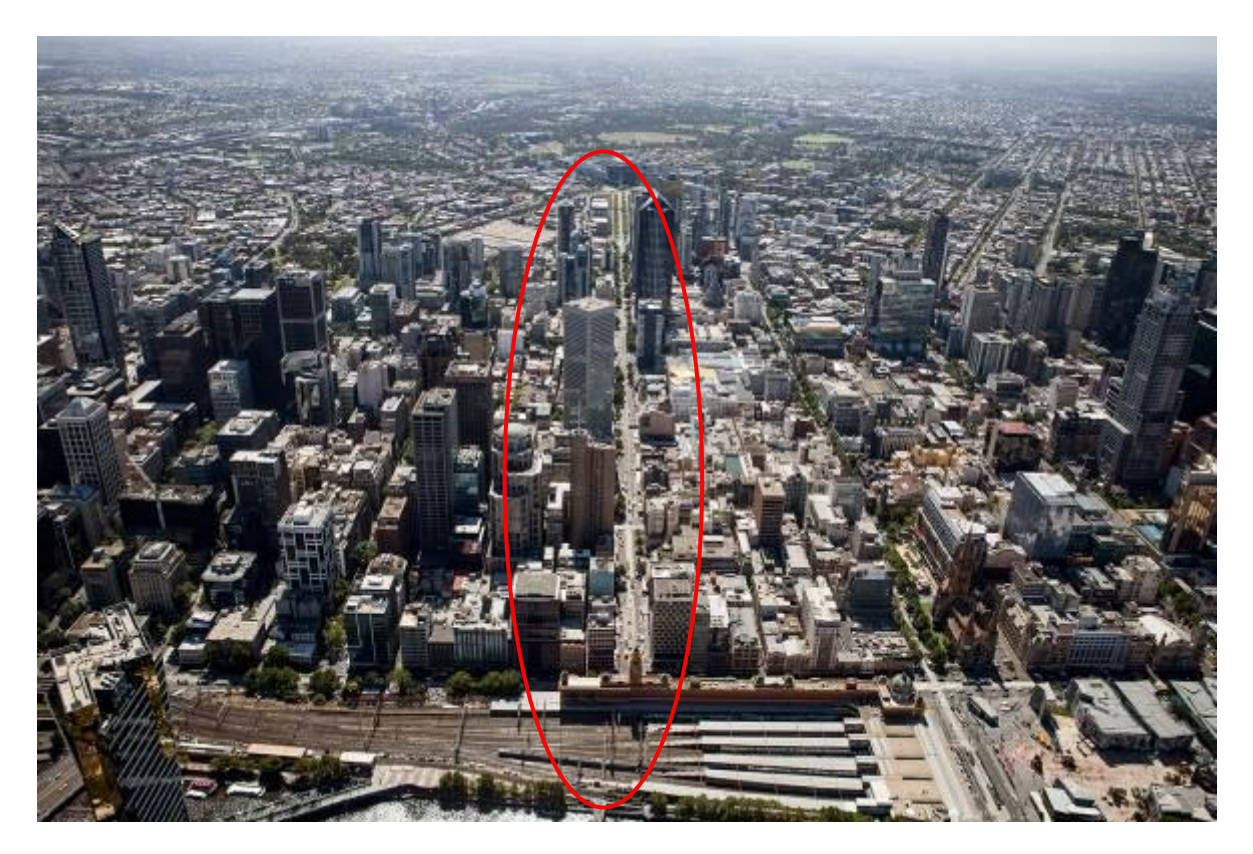
Elizabeth Street Melbourne