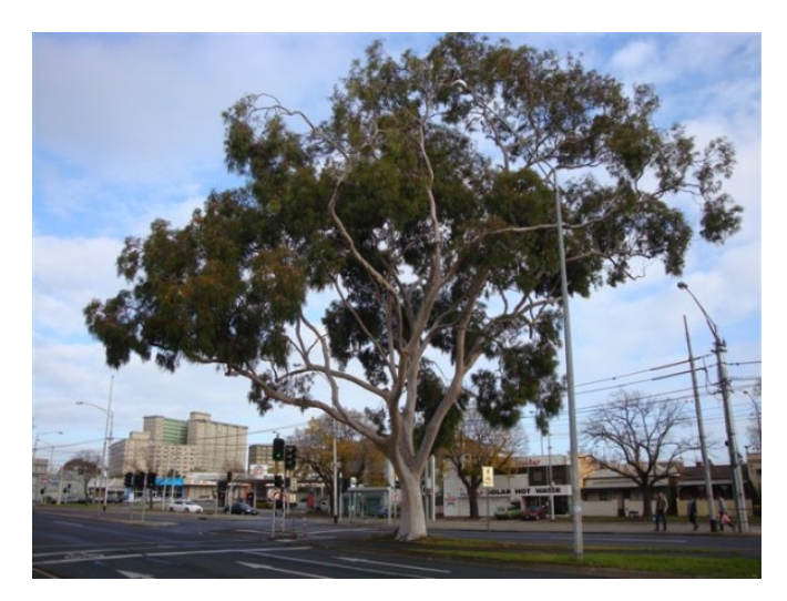
Fig. 1: National Trust-listed lemon scented gum at the Flemington Road / Church Street corner. (http://vhd.heritage.vic.gov.au/search/nattrust_result_detail/71367)