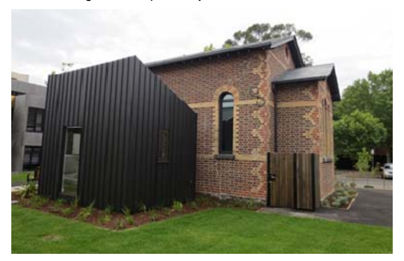
Figure 2: Photo of subject building.