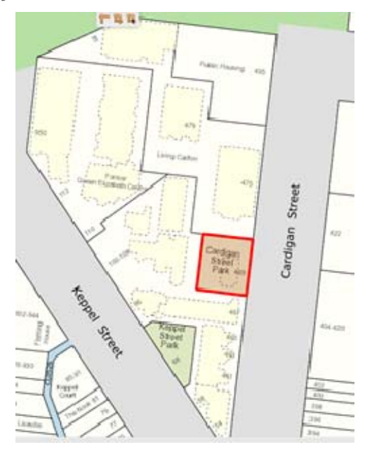
Figure 1: Map of subject site shown in red.