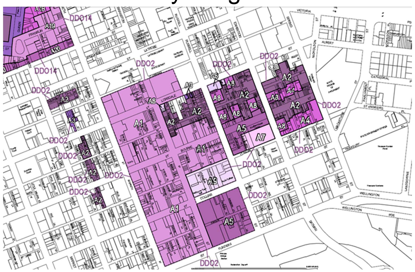
A1 (40 metre mandatory height control)

Central City Height Controls Attachment 3 Agenda Item 6.1 Future Melbourne Committee 9 April 2013