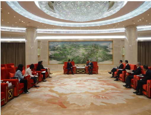
Courtesy Call with Chengdu Municipal Government.