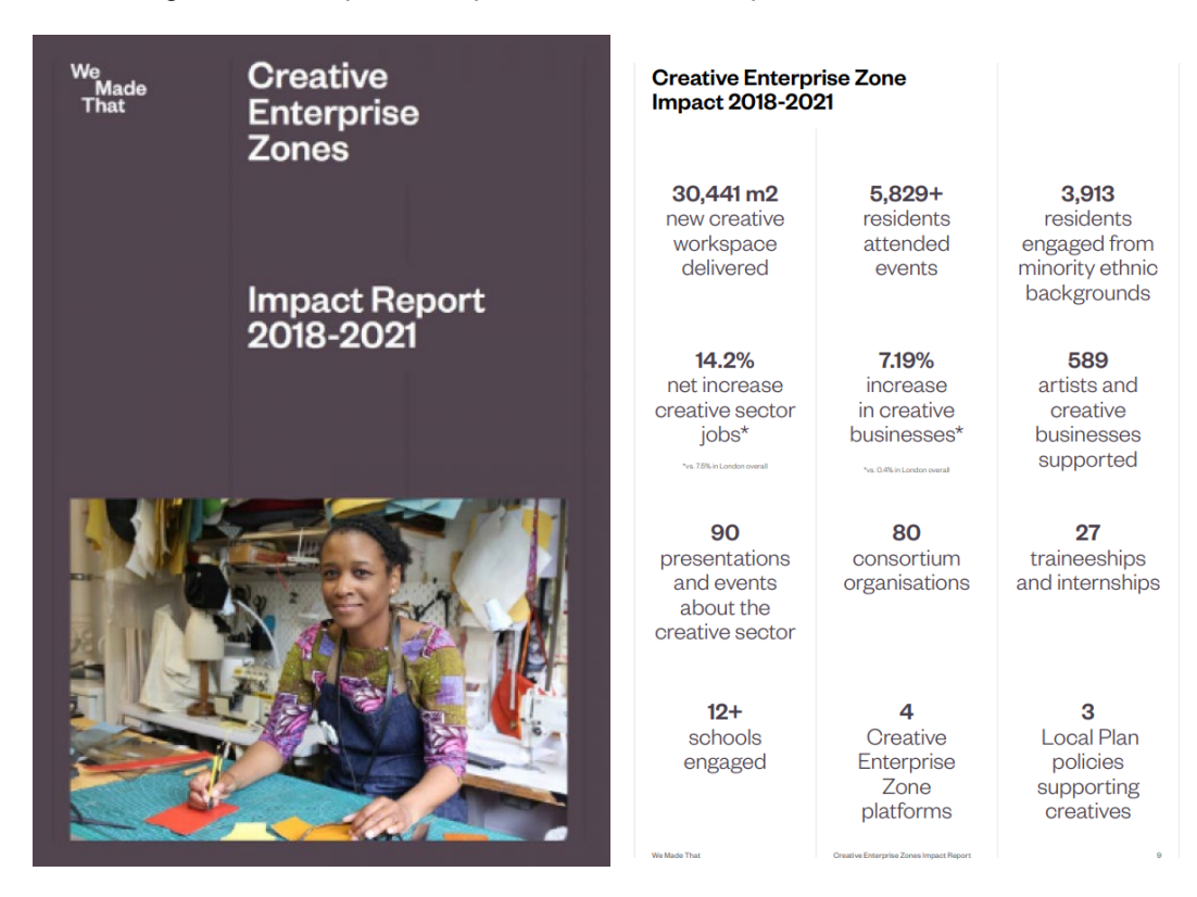
Link to Impact Report