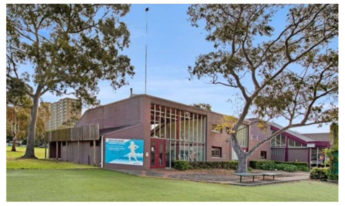
Image: North Melbourne Community Centre (NMCC), 49-53 Buncle Street

The community and service providers in our facilities have consistently expressed the desire for larger and improved facilities to allow for more spaces for community use and enhance the services that make a positive difference to life in North Melbourne.