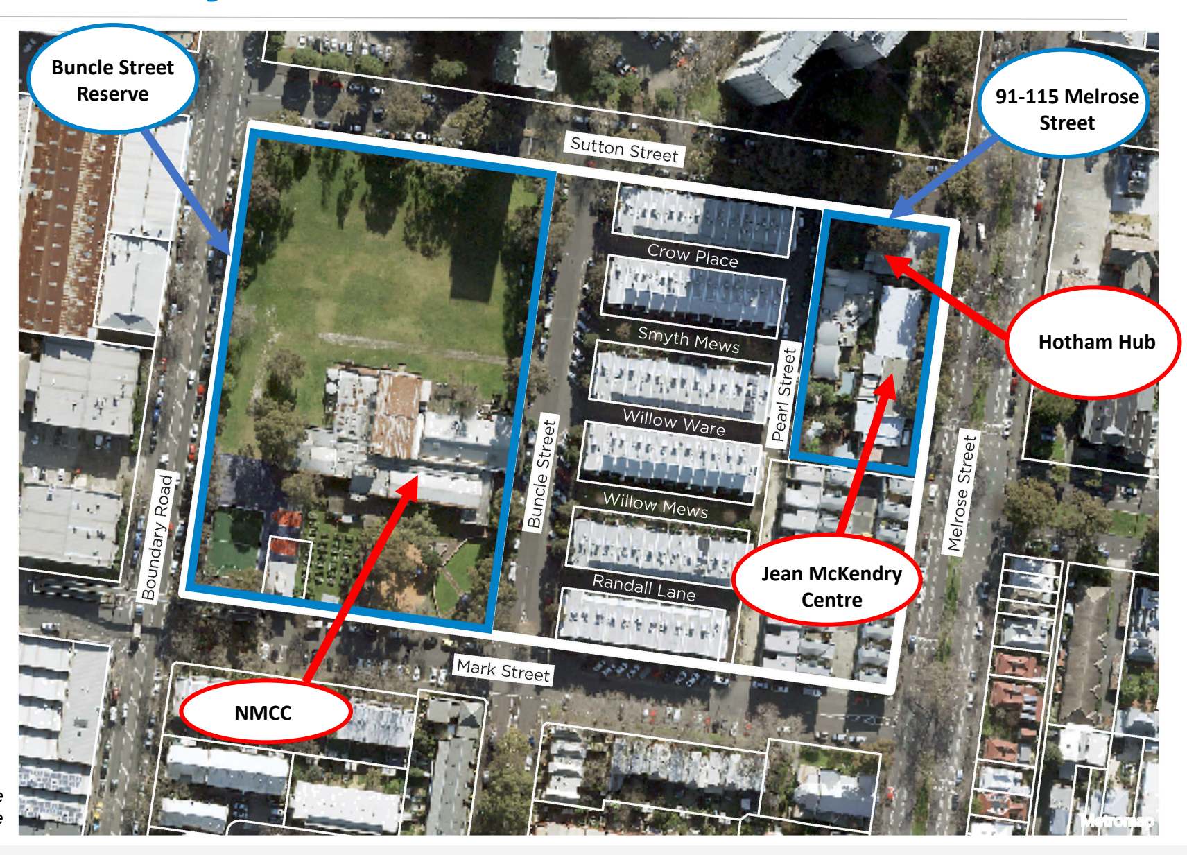
Image: Detailed map of Buncle Street Reserve and 91-115 Melrose Street, North Melbourne

In selecting the new site, consideration was given to how all CoM land in the precinct could be used to meet future population needs and provide increased community and recreation facilities, open green space and affordable housing.