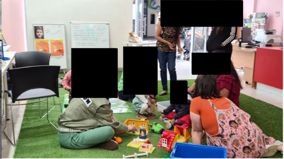
Afternoon Tea Play Sessions