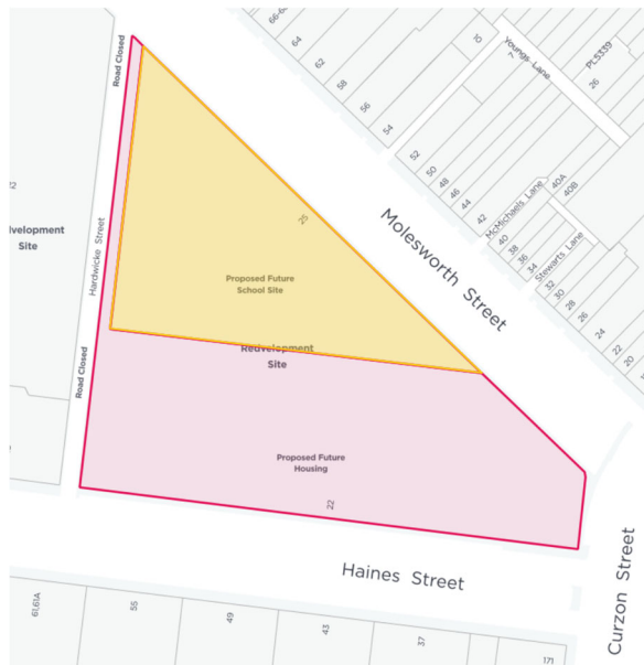
Figure 1 – Locality Plan

The new road is to be created as part of the works on the sites located at 10-36 Haines Street, 2-54 Hardwicke Street, 1-49 Molesworth Street, and 175-183 Curzon Street, North Melbourne.