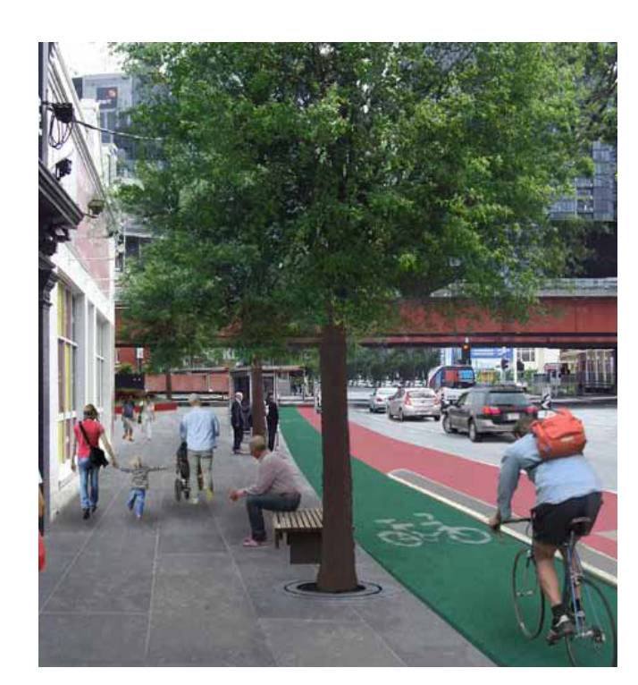
City Road Master Plan 2016 identified opportunities to widen footpaths along City Road, provide new bike lanes, and pedestrian crossings. (M1 - Improve Walkability, M2 - Expand the Bicycle Network, M4 - Reduce Car Use)