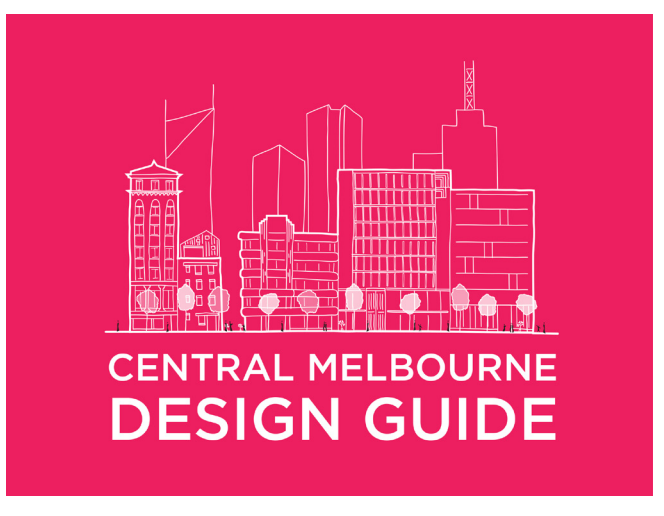
Amendment C308: DDO1 / Central Melbourne Design Guide was approved in September 2021. (B2 - Streetscape vision objective 2: a lively and characterful streetscape)

melbourne.vic.gov.au Southbank Report on Projects and Priorities 2010-2021