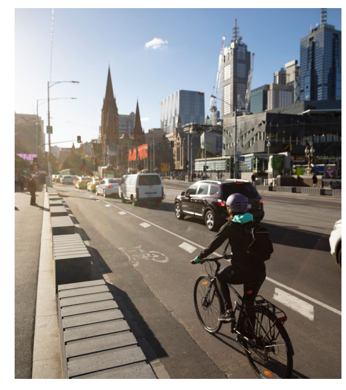
New bike lanes to provide safe and efficient connections. (M2 - Expand the Bicycle Network)