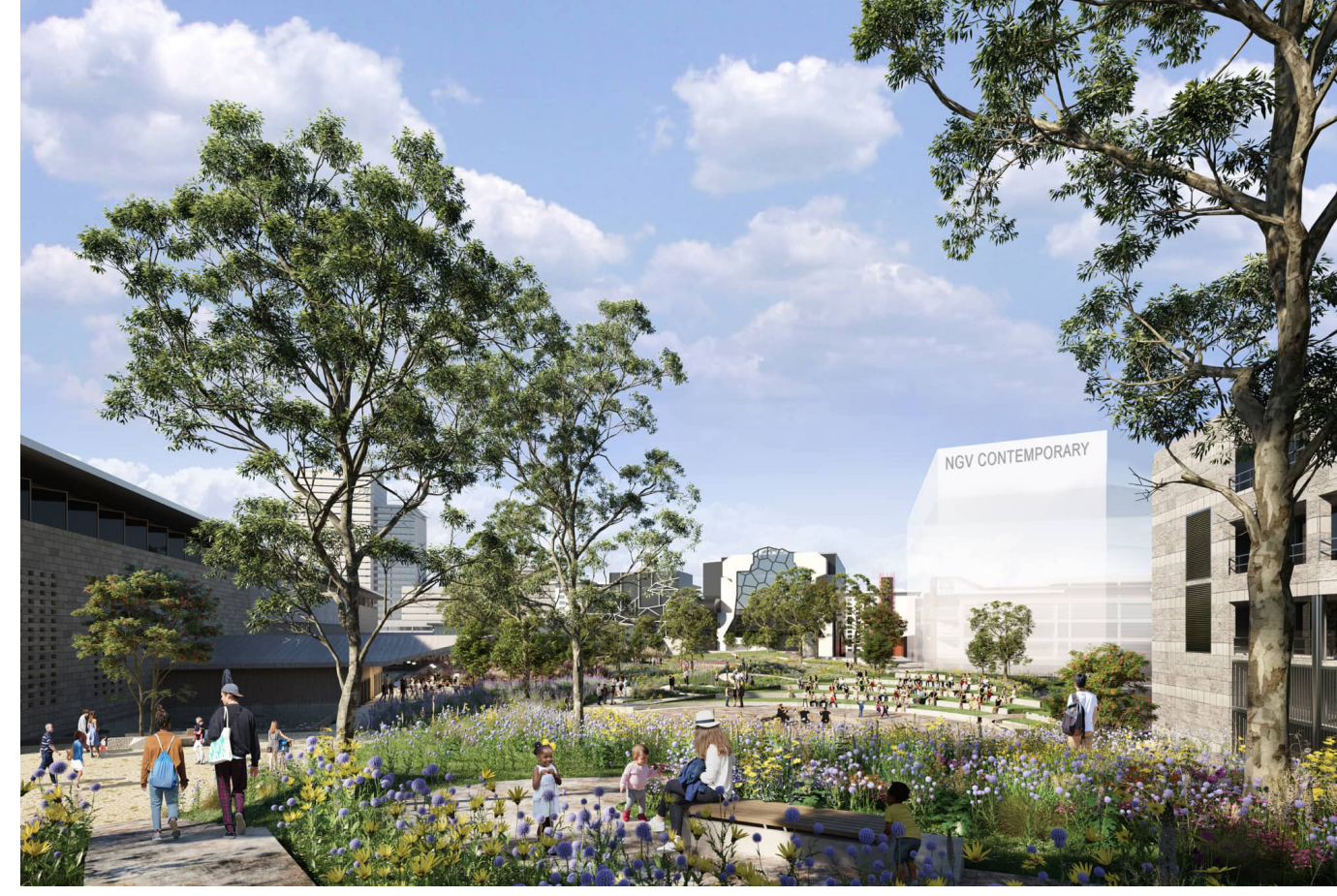
Artist's impression of the proposed Melbourne Arts Transformation Project (MATP).