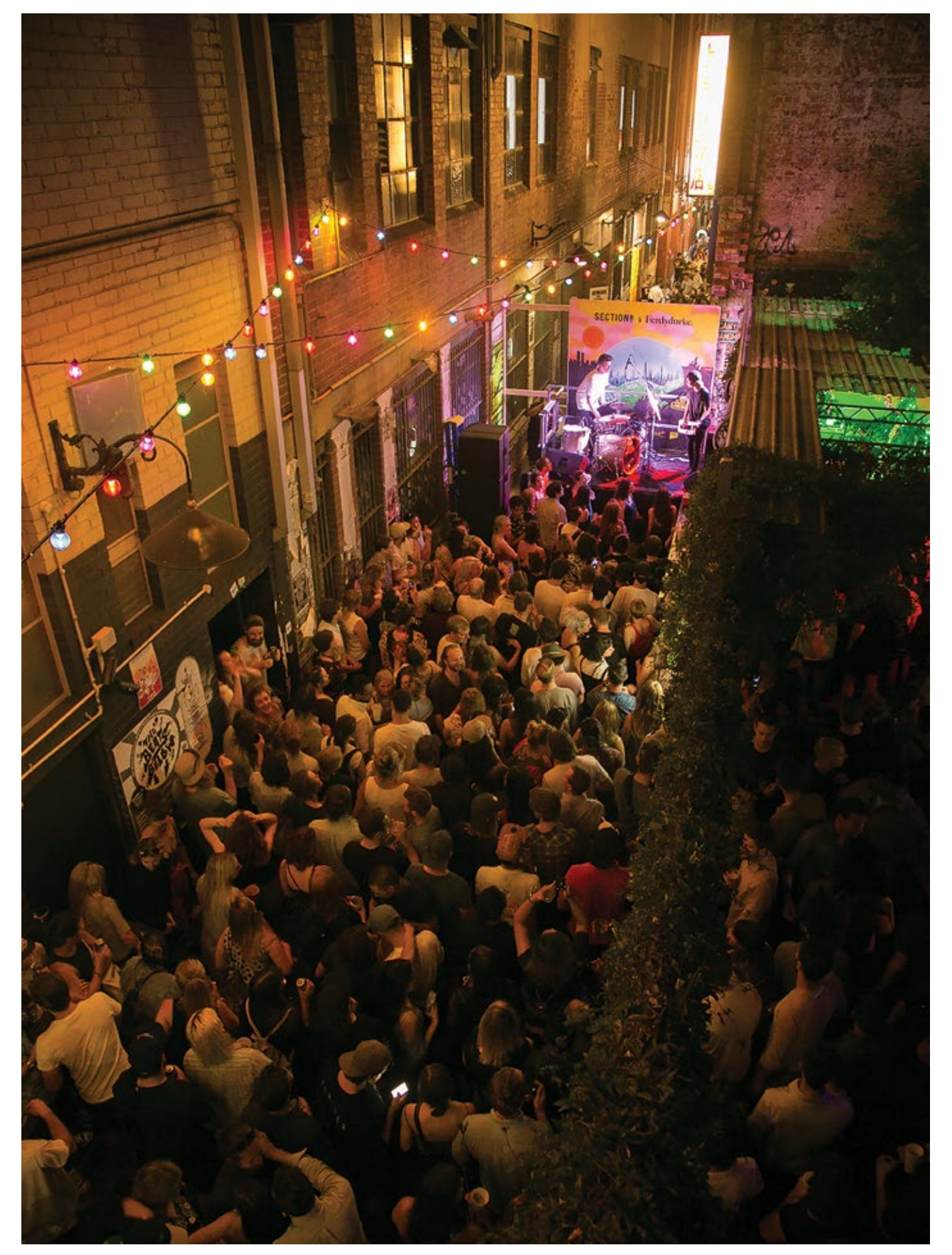
Melbourne Music Week 2017.