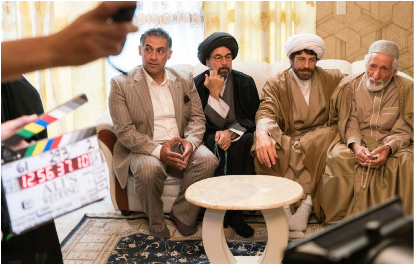
Ali's Wedding