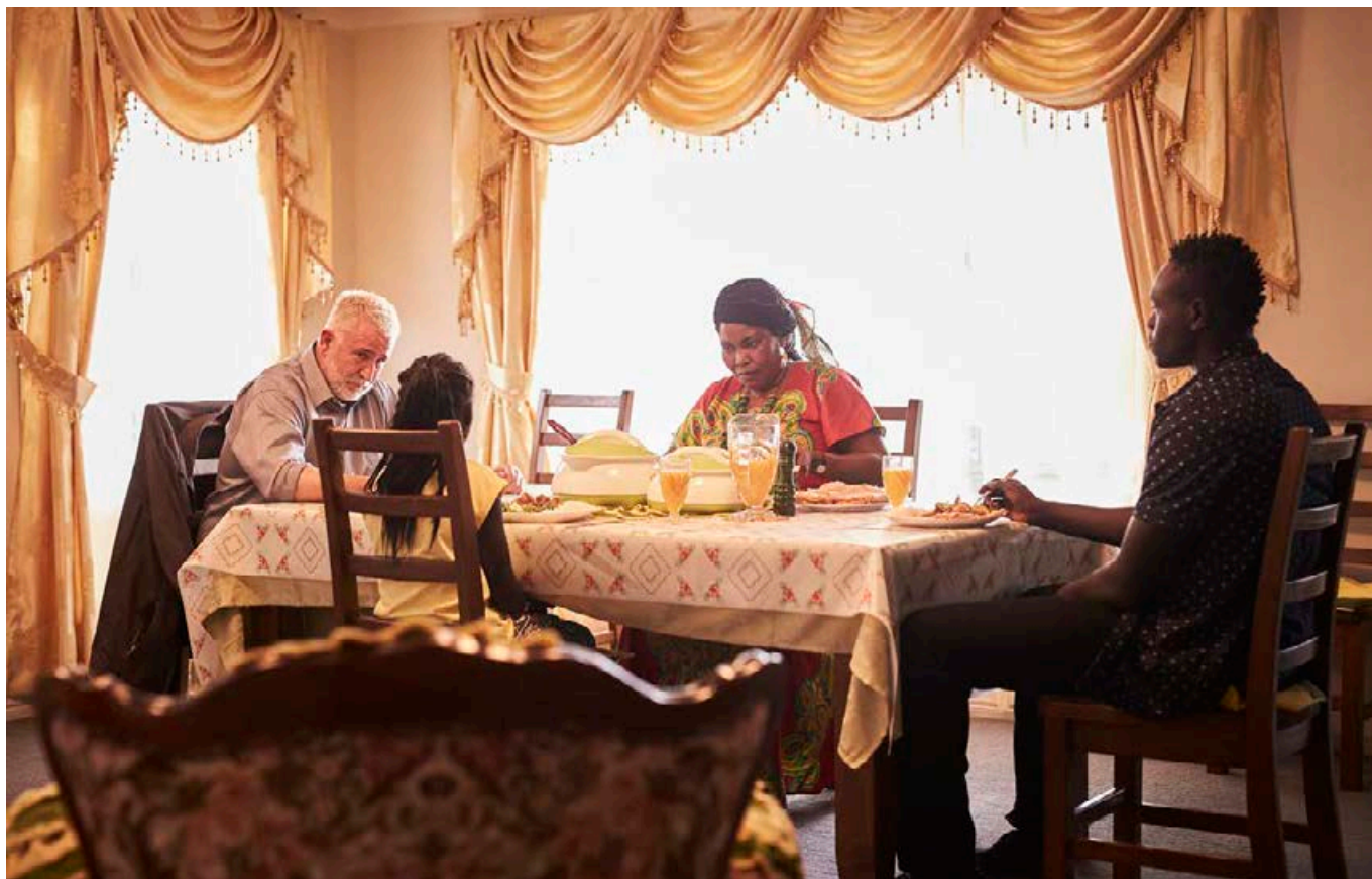
Above: Sunshine

You can email or phone (03) 9658 8858. Find out more about temporary and mobile food premises at Temporary food premises .