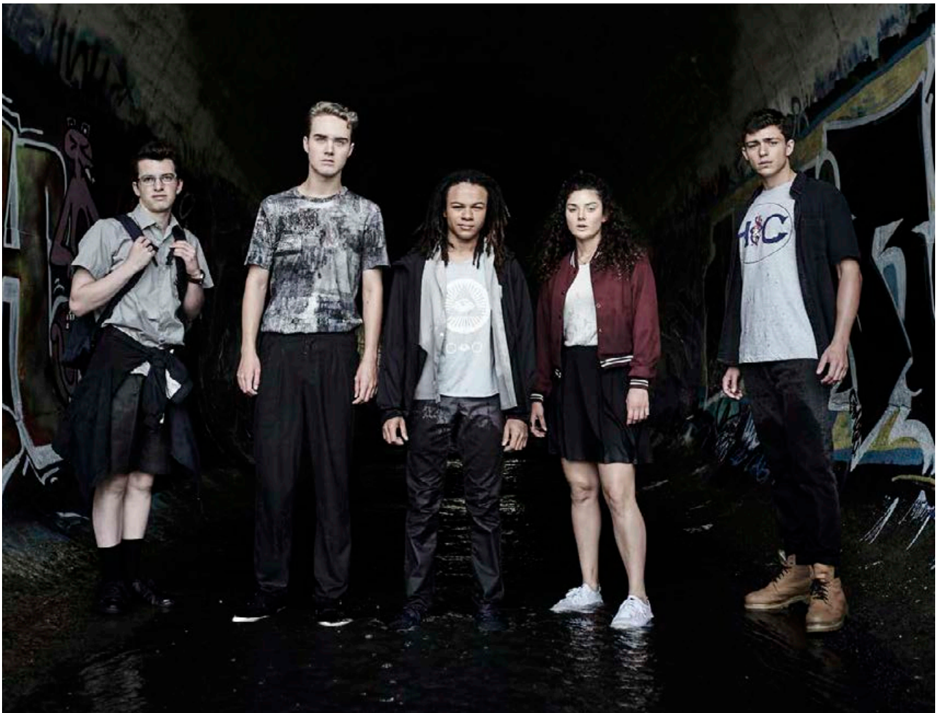
Nowhere Boys - photo courtesy Matchbox Pictures

For further information, please contact the Filming Officer on (03) 9658 8008 or email .