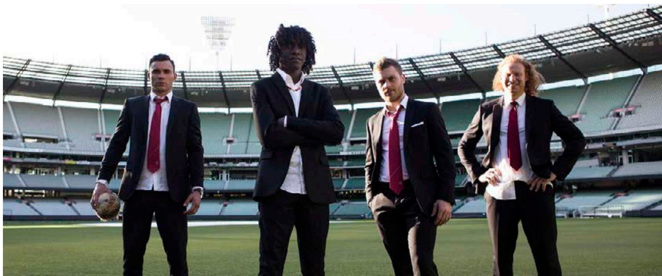
The Warriors