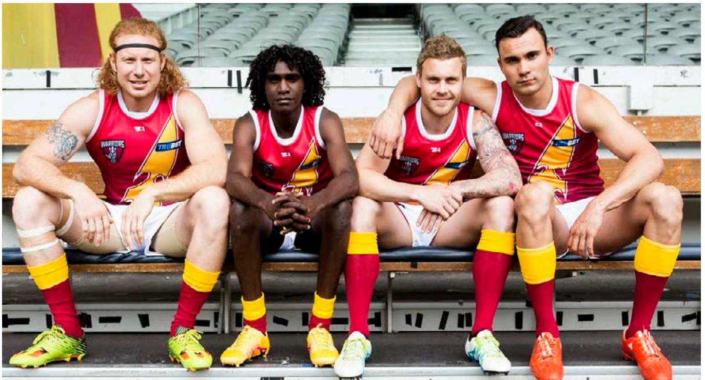
The Warriors