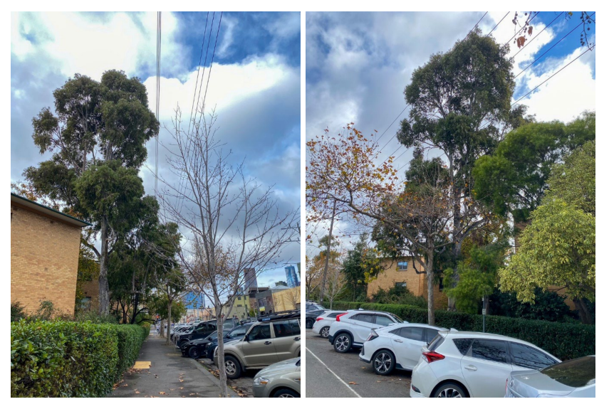
Figure 3: Views of Tree 157