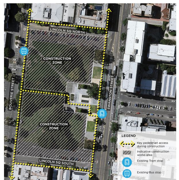
Plan illustrating works area and pedestrian access