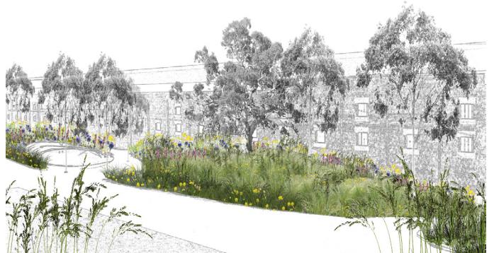
Artist impression of what Dodds Street Linear Park will look like in the future.