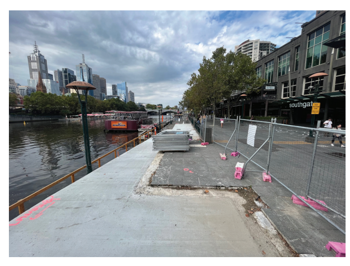
Works at the western end will recommence shortly