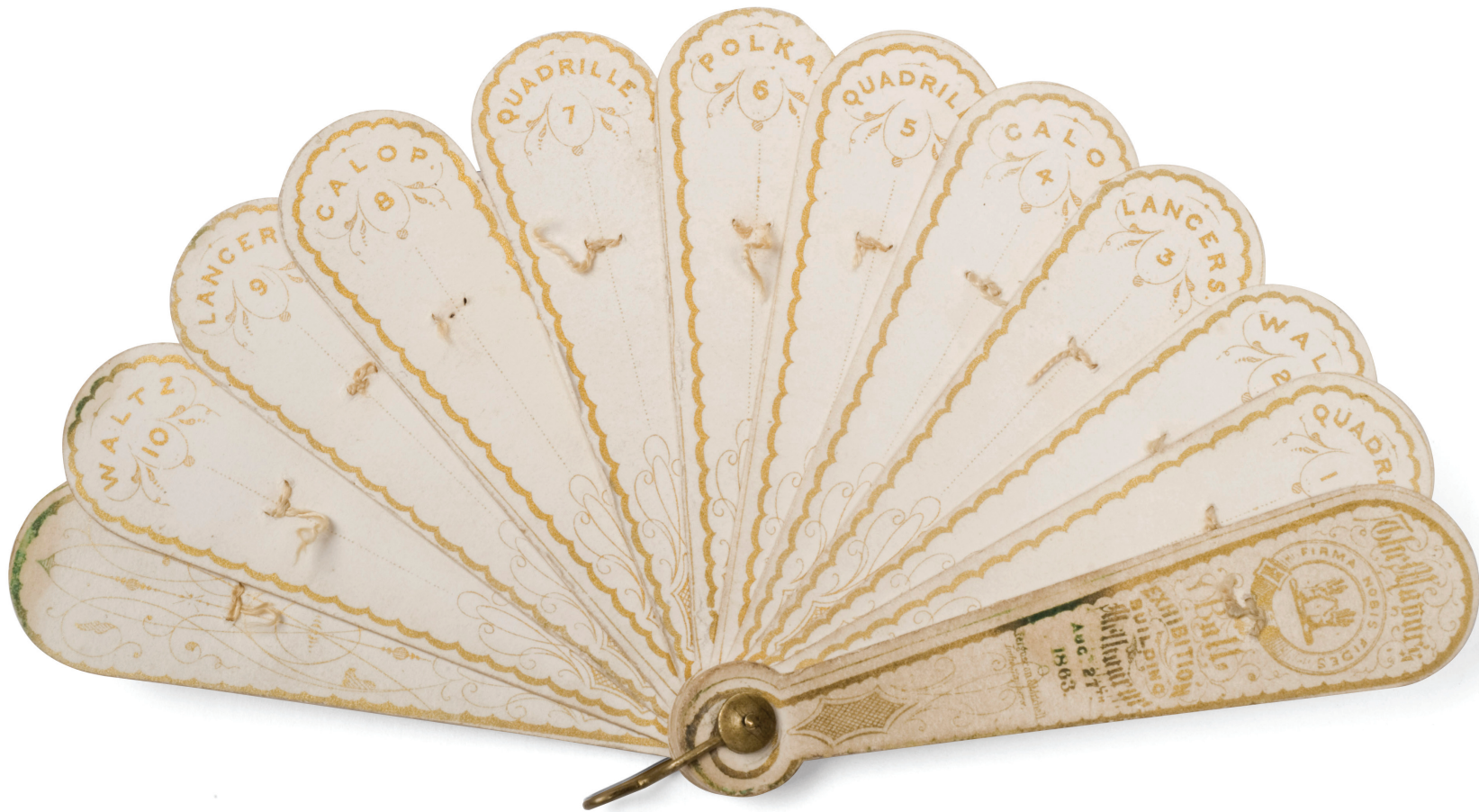
Dance Card in the shape of a fan Cards like this were given to ladies who attended the Lord Mayor's Ball in the Exhibition Building, William Street, in 1863.