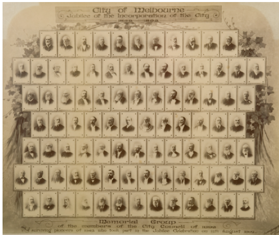
4. JOHNSTONE, O'SHANNESY & CO. City of Melbourne, Jubilee of the Incorporation of the City, 1842-1892 photographic collage