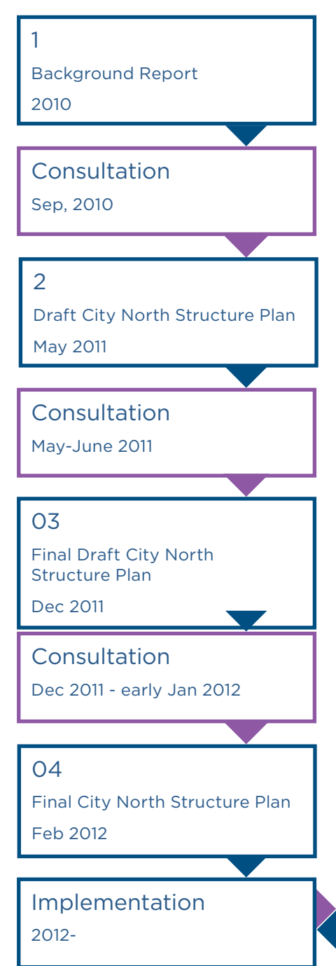
Figure 1.2 illustrates this process.

The City North Structure Plan was finalised with consideration of the comments received during the consultation period. The Plan was adopted by the Future Melbourne Committee in February 2012.