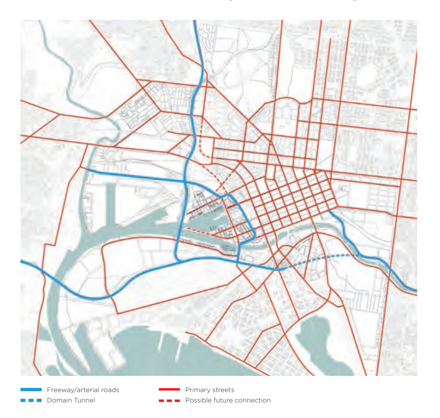
Fig 6.12 Arterial road network, 2012.

Docklands is bordered by several key arterial roads (Wurundjeri Way, Footscray Road, City Link and Westgate Freeway) with the primary purpose of enabling efficient freight and commuter movements across the broader road network. These roads generally do not support non-vehicle modes of transport and create significant barriers to pedestrian and cyclist movements and amenity.