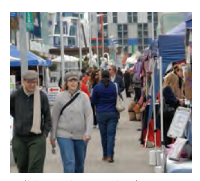
Weekly Sunday market, NewQuay Central.