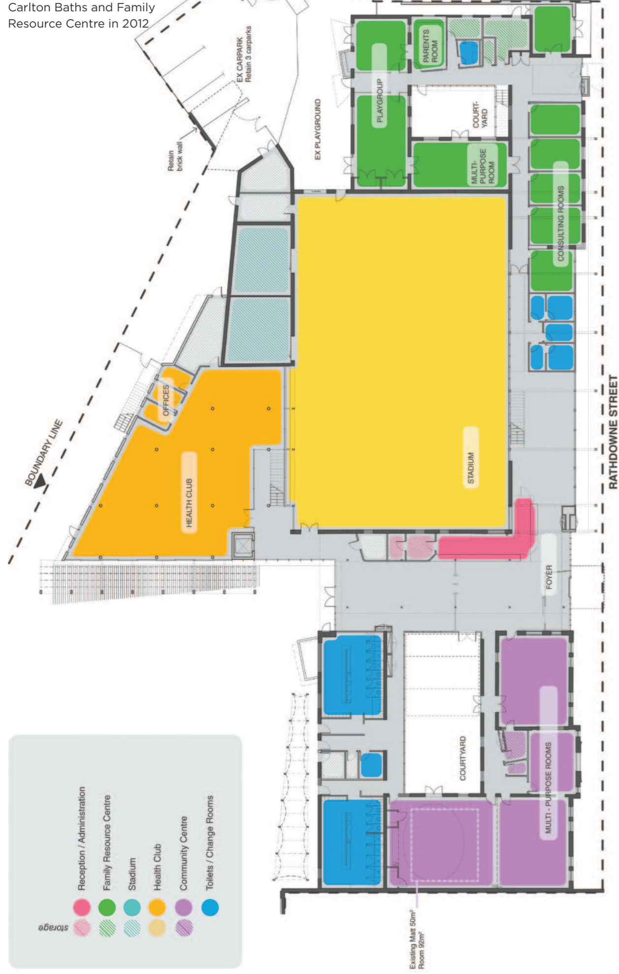
PROPOSED GROUND FLOOR PLAN 1:250

Projected image of Carlton Baths and Family Resource Centre in 2012