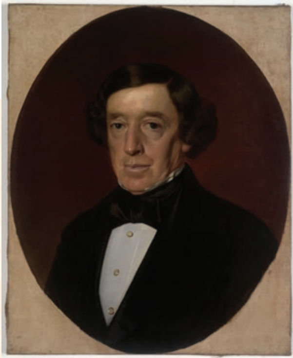
George Augustus Robinson, 1853