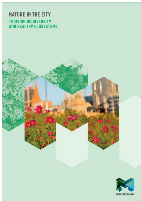
City of Melbourne Nature in the City Strategy.

Collaborators including other governments, the Royal Botanic Gardens Victoria and universities are identified in these strategies as critical to delivering the city's strategic outcomes.