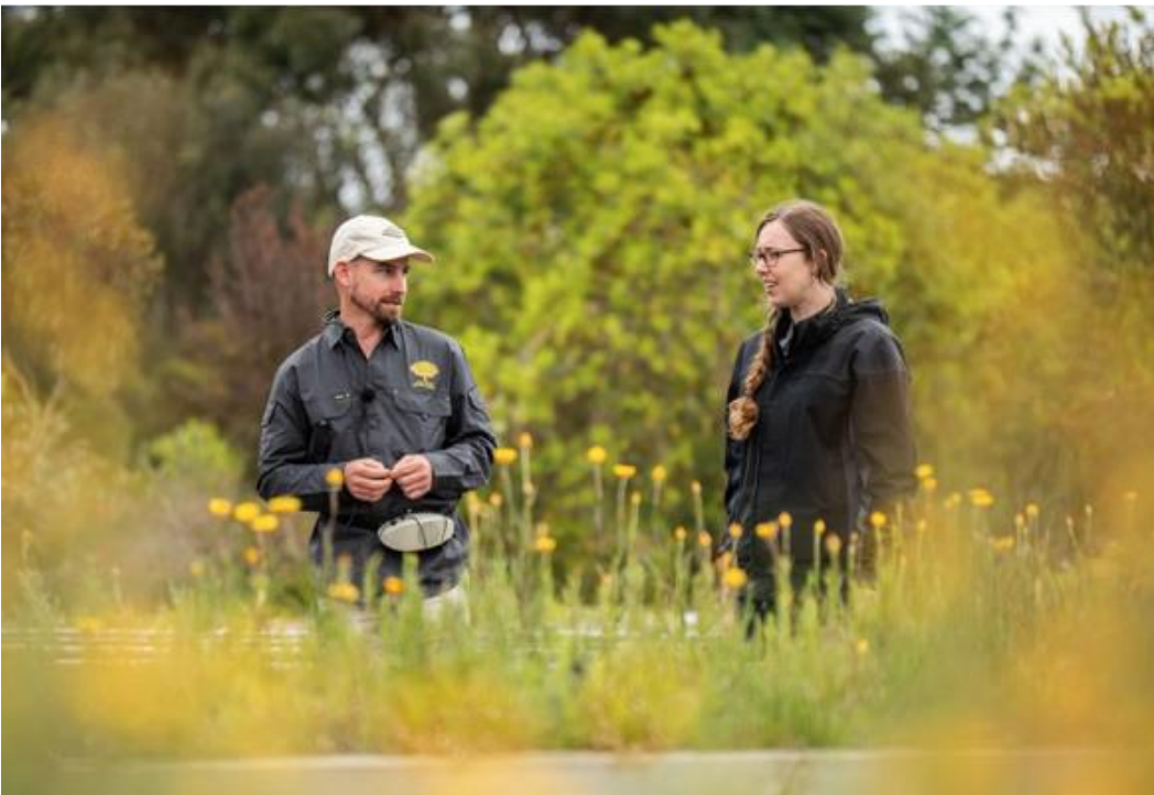
A Living Collection: The yellow flowered Swamp Everlasting pictured in the Raising Rarity outdoor research plots, within the Australian Garden Cranbourne, Royal Botanic Gardens Victoria.

The Australian Government legislation for describing and protecting threatened species is the Environment Protection and Biodiversity Conservation Act 1999 (EPBC Act), and the Victorian Government legislation is the Flora and Fauna Guarantee Act 1988 (FFG Act). Currently, 1419 plant species are listed as threatened at a national level under the EPBC Act and over a third of all Victorian plant species are listed under the FFG Act at a state level.