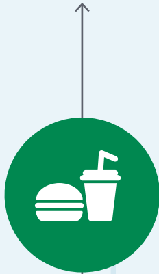
Food and drinks