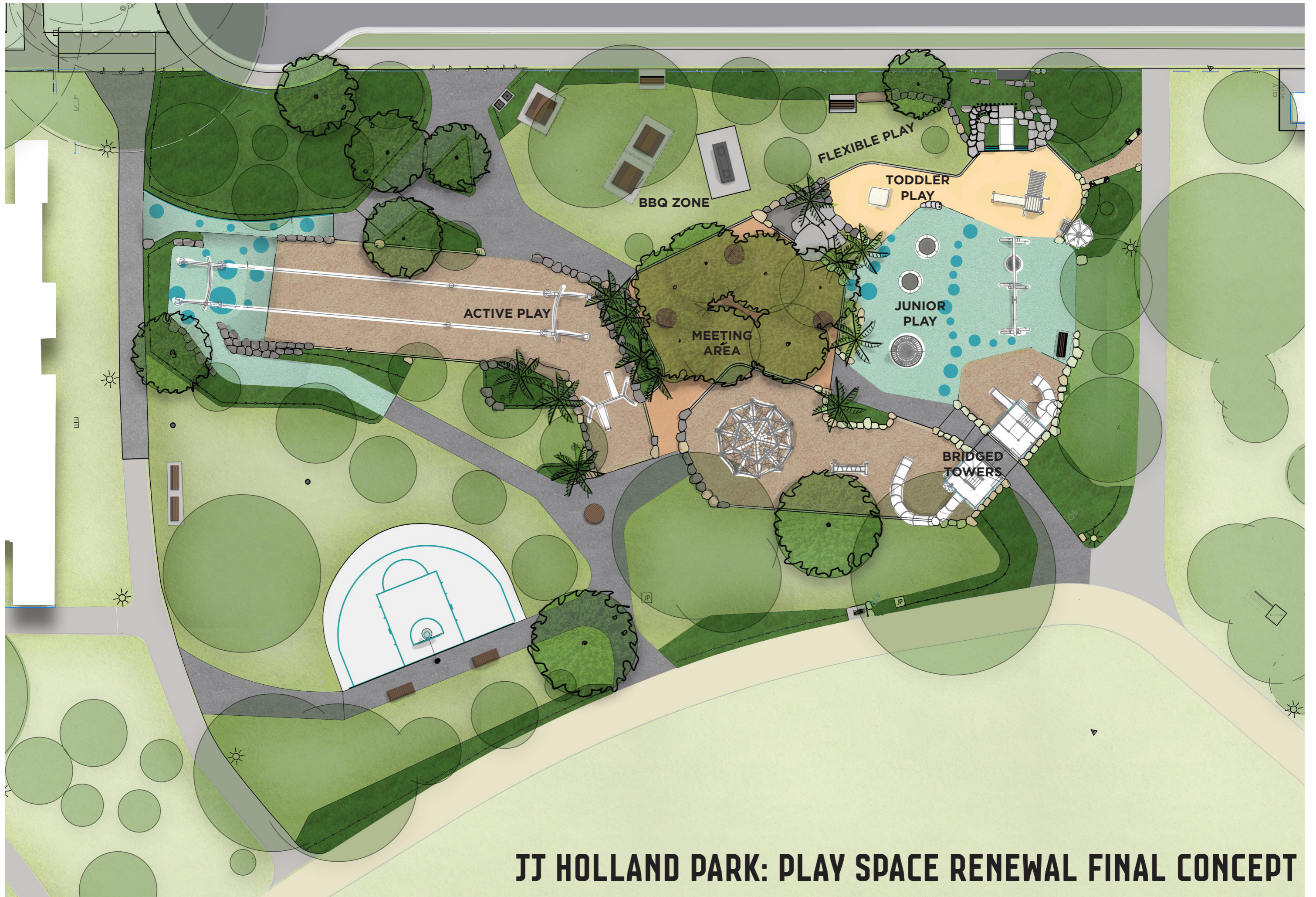
JJ HOLLAND PARK: PLAY SPACE RENEWAL FINAL CONCEPT