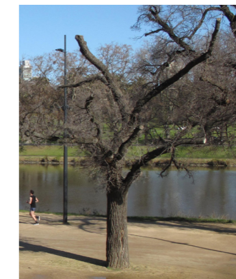
Elm trees in poor health