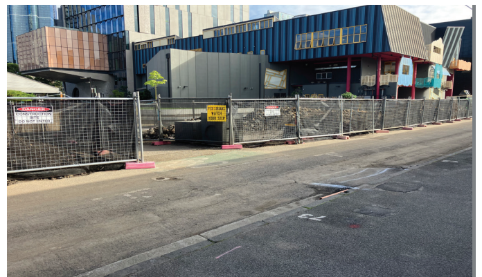
A temporary crossing point in Dodds Street