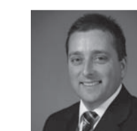
The Honourable Matthew Guy MLC Minister for Planning

The projects outlined in this guide will also be delivered alongside ongoing infrastructure projects such as improved public spaces, additional popular parks, improved pedestrian routes and the expansion of the business networks along with the continued delivery of community infrastructure such as a place of worship and public art projects.