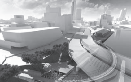
57. The Jim Stynes Bridge (artists impression)