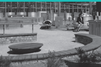
8. Community Garden at Victoria Harbour