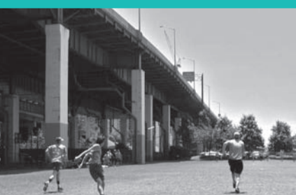
32. Community and Sporting Facility in North-West Docklands (benchmark image)