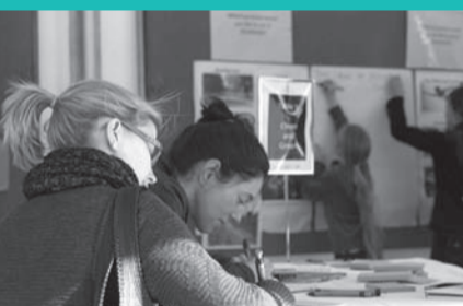
23. Neighbourhood Community Centre at Yarra's Edge