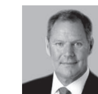
The Rt Hon. Robert Doyle Lord Mayor of Melbourne

This document outlines a raft of community infrastructure projects to be delivered in Docklands over the next 10 years and beyond, which when complete will total close to $300 million. It demonstrates the strong, long-term partnerships between state and local government and the private sector that are required to make urban renewal projects a success.