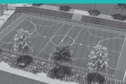
26. Outdoor Multi-Purpose Courts (benchmark artists impression)