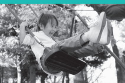
27. Park Improvements (benchmark image)