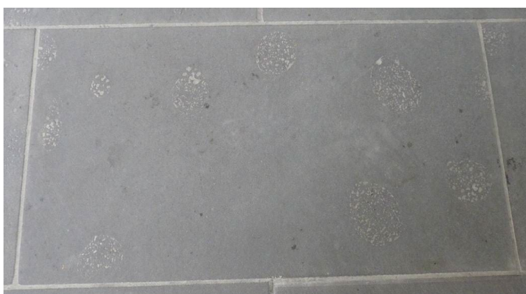
Figure 5: 10% vesiculation