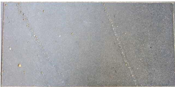
Figure 2: Veining

To maintain the aesthetic character of bluestone used in the walkways of Melbourne the presence of vesiculation within the bluestone material is required. Vesiculation refers to gas pores within the stone more commonly appearing as round agglomerations, colloquially known as 'Cats paws' or in long thin strips known colloquially as 'veining'. Vesiculation may also appear as broad irregular shapes which are also permitted. Examples are shown below.