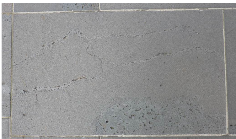
Figure 6: 18% vesiculation