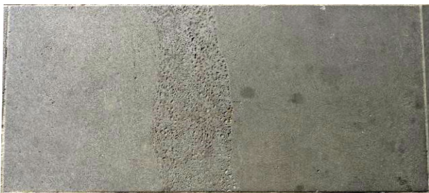
Figure 3: Broad irregular shapes