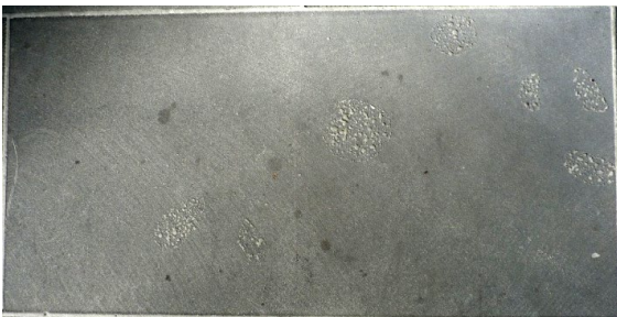
Figure 2: catspaws