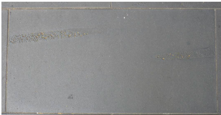
Figure 4: 5% vesiculations