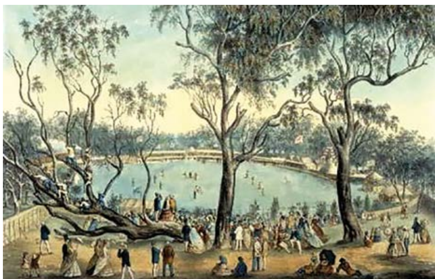
The Melbourne Cricket Ground, fringed with gum trees, 1864