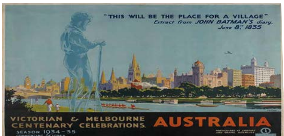
'This will be the place for a village', publicity poster issued for the Centenary Celebrations, 1934-35, Percy Tromf.

Thematic histories, heritage studies and the wealth of materials and extensive local history collections in Melbourne's library network are a resource for future interpretation. Opportunities for historic interpretation have also expanded from the traditional modes such as signage, to new technologies, for example podcasts, e-trails and mobile phone/PDA applications.