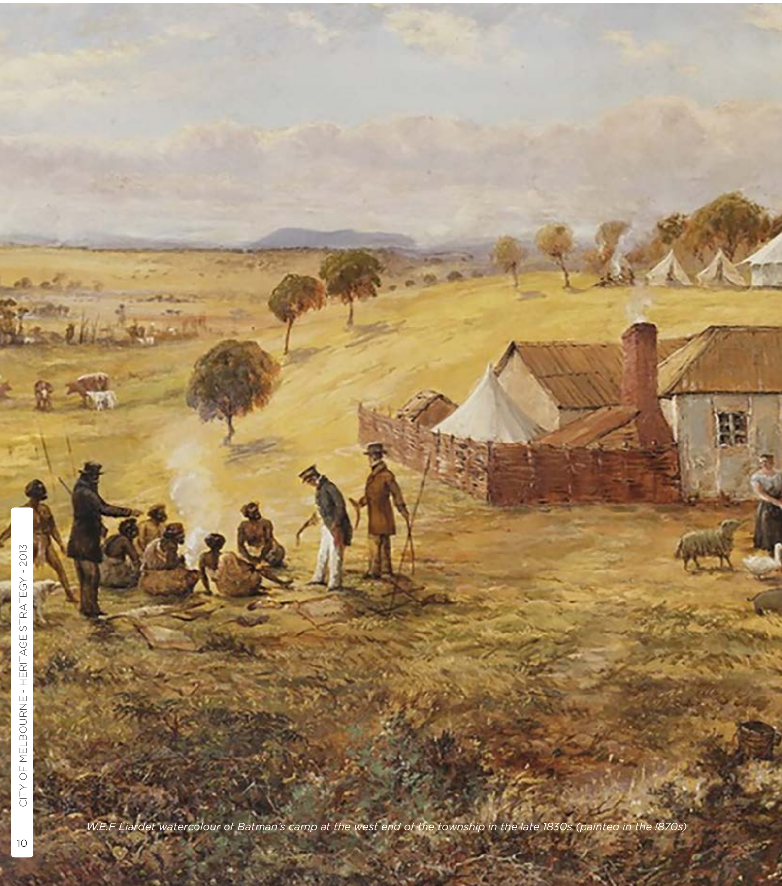
W.E.F Lardet watercolour of Batman's camp at the west end of the township in the late 1830s (painted in the 1870s)